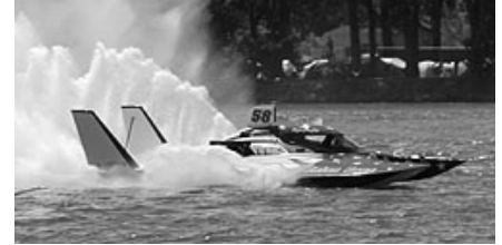
Hydroplane on Black Lake 2009

Each year, hydroplanes hit record-breaking speeds on lake making the Black Lake Regatta one of the most exciting and well-attended events of the tour.